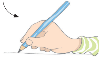
The tripod grip for right-handers

Left-handers should hold pencil slightly further up from tip